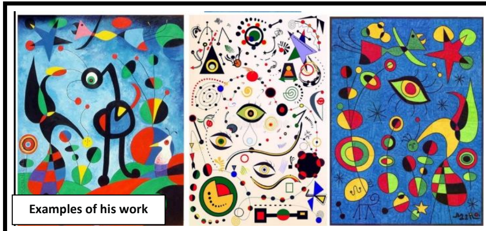
Examples of his work