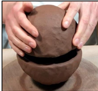
Use two balls of clay and make pinch pots.