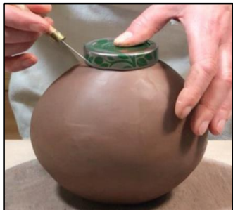
Mark out the neck.