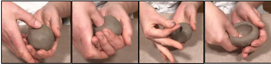
Basic pinch pot technique