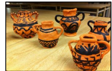
Examples of work