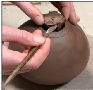
Remove excess clay.