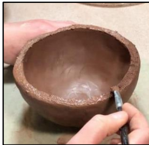
Score and slip the two surfaces to join them.