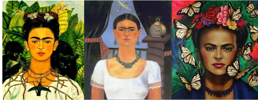
Examples of her work