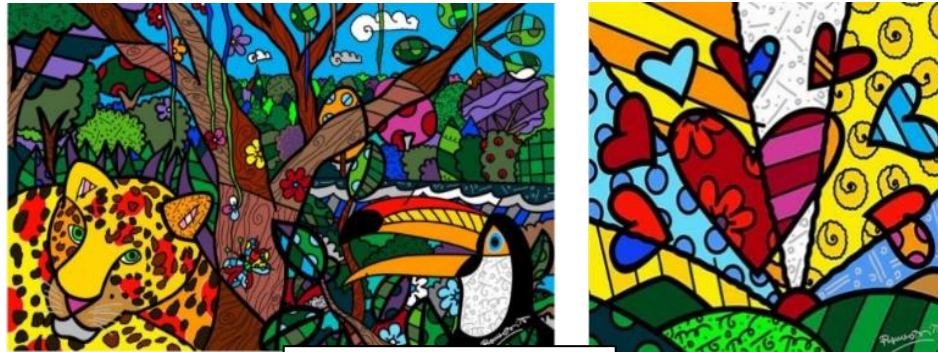
Examples of his work