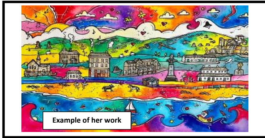
Example of her work