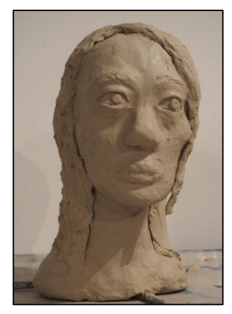
Examples of work