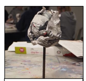
Tightly scrunch paper to create desired shape.