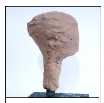
Secure strength and shape before adding features.