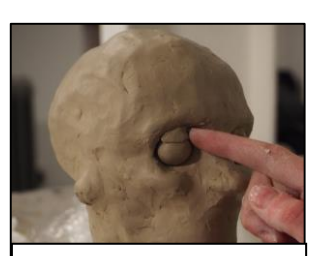
Add balls of clay for the eyes and add philava