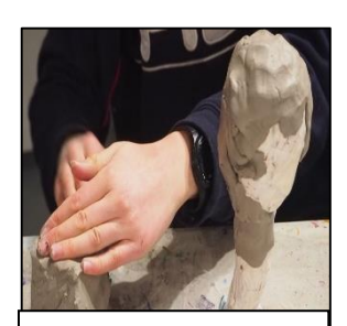
Add clay. Pad out with further paper if shoulders are