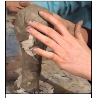
Smooth the surface.