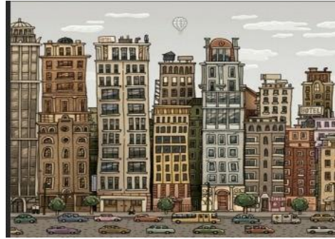
Examples of his work