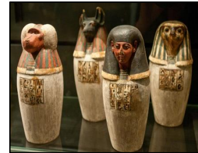
Using Egyptian Artefacts

During Year 4 we learn about Ancient Egypt and its culture. We will use our topic work as inspiration for creating our own Egyptian style canopic jars.