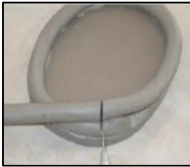
Cut coils as shown.