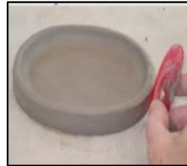
Smooth the clay.