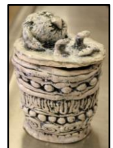
Examples of work