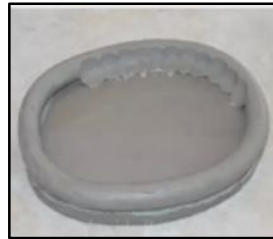
Pinch coil into base - inside and outside.