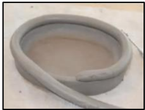
Add 2 nd coil without slip and score. smudge into lower coil.