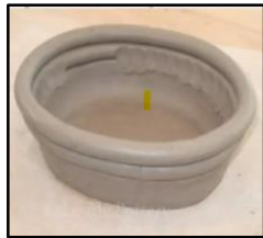
Repeat to build up the height.