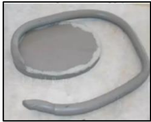
Score and slip base and add first coil.