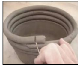
Join the coils in different places to give strength.