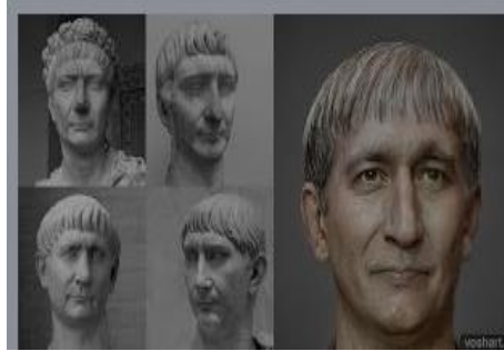
Examples of his work