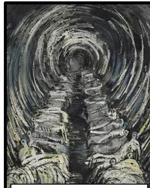
Examples of his work