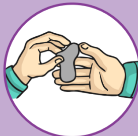
Pulling and pinching the clay with your fingers