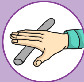
Rolling snakes with clay