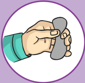
Squeezing the clay