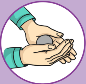
Rolling a ball of clay