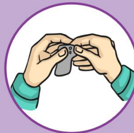
Smoothing out the clay with your fingers