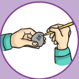
Carving details into the clay with tools