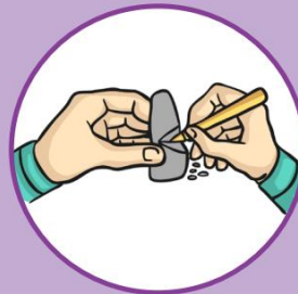
Creating holes or hollows in the clay with tools